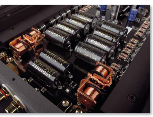
The most elegant solution for a protection circuit: Two separate relays made of solid copper separate the loudspeakers when necessary, naturally process-controlled.