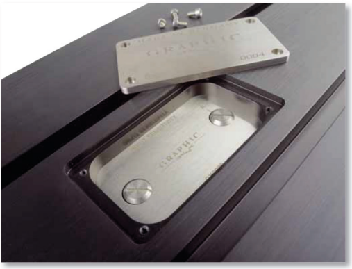
Beneath the front chrome cover, there is the power choke typical for the Brax. To the right of it is the small driver power supply. The only control elements are the channel-separated volume adjusters, which are hidden underneath the cover.

After all, it was a matter of honor to bring the X, developed 18 years ago, up-to-date. The G in GX stands for Graphic, and we remember it from the Brax history. It used to stand for versions of the X amplifier that underwent additional tuning; with the current GX, Brax is introducing the name Graphic as a series name in addition to Matrix. Now they are specially tuned at the factory, as this used to imply meticulous selection of transistors, which is exactly the case with the GX now as well. And instead of the interconnects being reinforced with silver wire, the new GX features a 4-layer circuit board offering a much higher conductor cross-section.